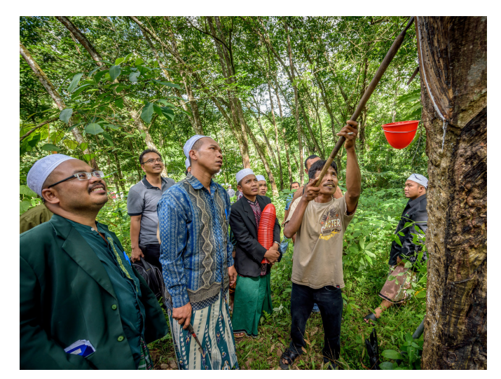
The CSL is hosting a workshop in 2019 to clarify and finalize the Coalition's objectives, operating processes and activities within and across various landscapes.