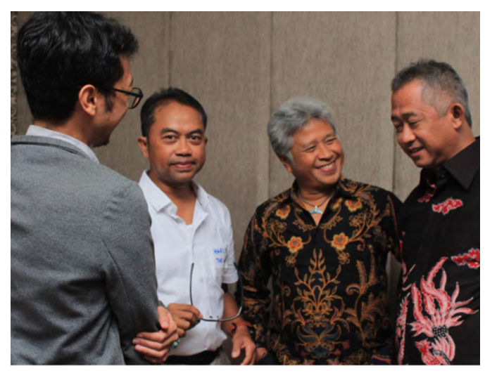
More than 130 representatives from across government, private sector, financial institutions and civil society joined the CSL's initial supporters at the Coalition's development workshop in September 2018.