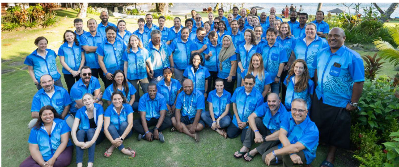
Field practitioners and technical experts from CI Global at the Warwick Resort in Fiji for the Global Seascape Workshop

As Conservation International (CI) Fiji, we had the immense pleasure of hosting the annual Global Seascape Workshop in May 2023. This remarkable event, which has been a cornerstone of our efforts for an incredible 18 years, provided a vital stage for seascape practitioners and partners from CI across the world to come together, to exchange ideas, and to renew our shared dedication towards sustainable seascapes.