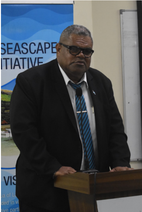
Minister for Agriculture and Waterways, Hon. Vatimi Rayalu

As part of Conservation International Fiji, we're in the process of developing the Sustainable Blended Financing Framework, a fresh initiative specifically designed for the Indigenous-led Lau Seascape. Our aim is to place people at the core of sustainable development, bringing together public and private funding to boost conservation efforts and foster sustainable livelihoods.