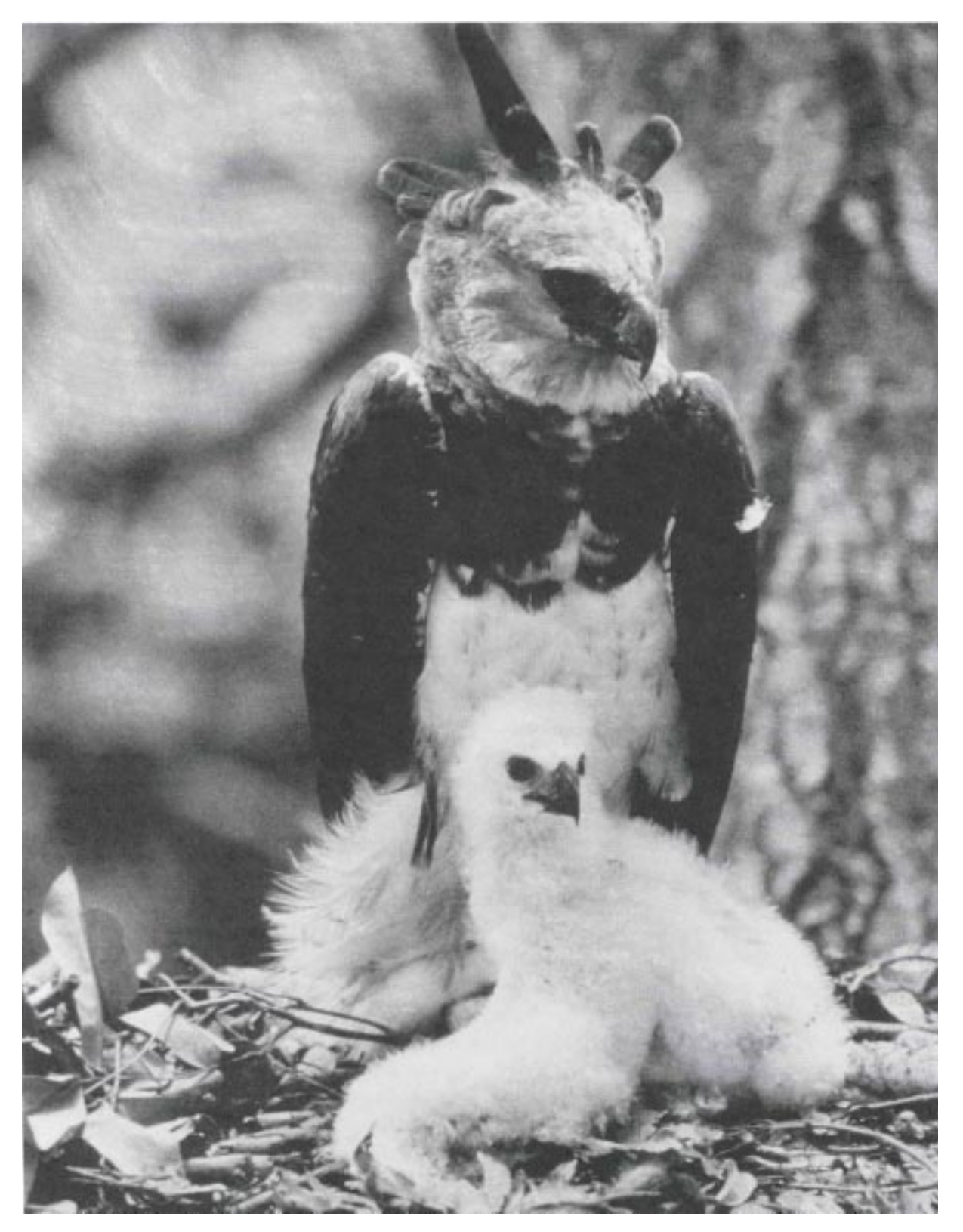
Adult Harpy Eagle ( Harpia harpyja) with young at nest, Kanuku Mountains, August, 1991.