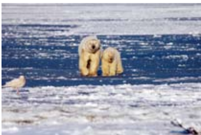
POLAR BEARS ( URSUS MARITIMUS ), ARCTIC NATIONAL WILDLIFE REFUGE, ALASKA.