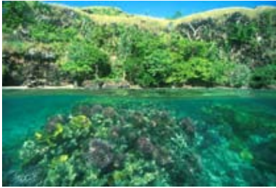
PAPUA NEW GUINEA, MARINE RAR

Conservation International believes that the Earth's natural heritage must be maintained if future generations are to thrive spiritually, culturally, and economically. Our mission is to conserve the Earth's living heritage — our global biodiversity — and to demonstrate that human societies are able to live harmoniously with nature.