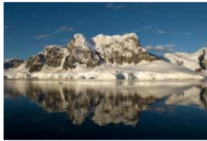
PARADISE HARBOR, ANTARCTICA.

How it impacts human welfare: Ocean currents play a major role in maintaining Earth's climate. For example, Europe's relatively mild climate is maintained in part by the large Atlantic current called the Gulf Stream. Changing these currents will have major implications for the climate across