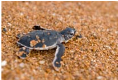
SEA TURTLES CAN LOSE THEIR NESTING BEACHES TO SEA LEVEL RISE, AND THEIR MIGRATORY PATTERNS MAY BE AFFECTED AS OCEAN CURRENTS CHANGE.

How it impacts human welfare: Although only 2 percent of the world's land lies at or below 10 meters of elevation, these areas contain 10 percent of the world's human population—634 million people that are directly threatened